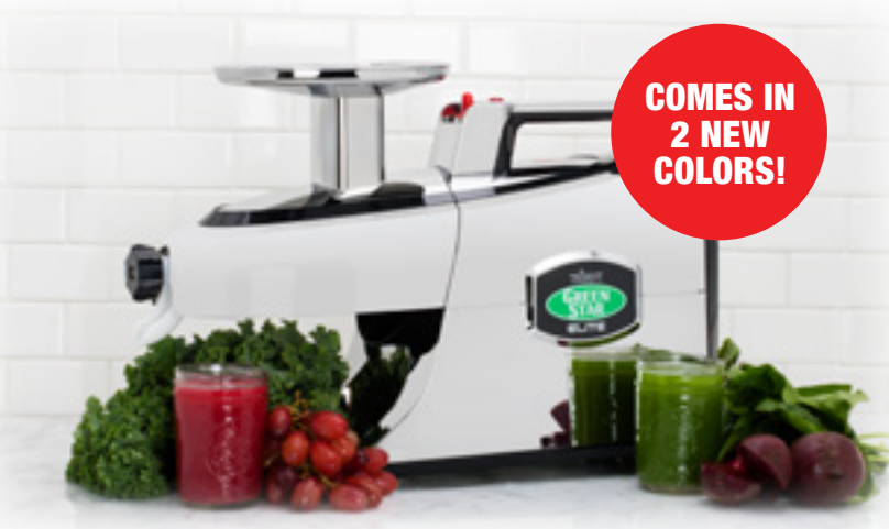
NEW! Greenstar Elite, GSE-5050 (Chrome)