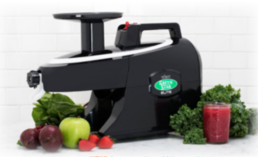
NEW! Greenstar Elite, GSE-5010 (Black)