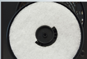
Washable Air Filter